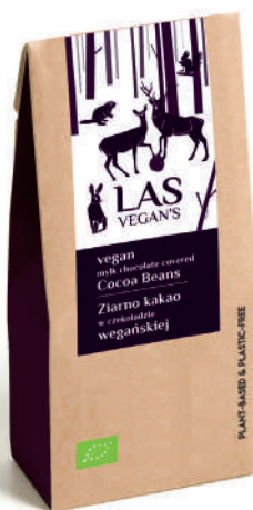
vegan mylk chocolate covered Cocoa Beans

We are immediately ready to sell the above six polished and tested chocolate bars. We promise to expand our offer with new flavors and types of tablets. But we don't want to stop there! We already have many tests and implementations behind us. We already wish to present four more products on which work is already being completed. We invite you to contribute to the next Las Vegan's vegan products development.