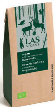
Hazelnuts in vegan mylk chocolate