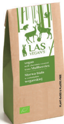
vegan mylk chocolate covered Mullberries