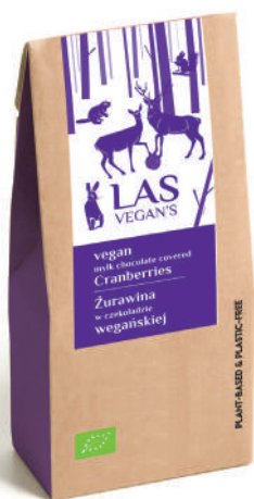
vegan mylk chocolate covered Cranberries